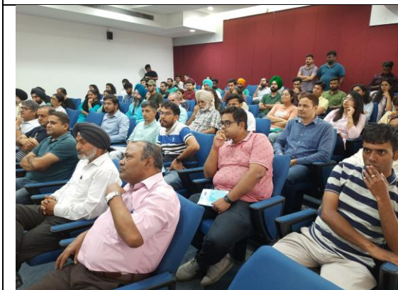
Workshop attended by participants