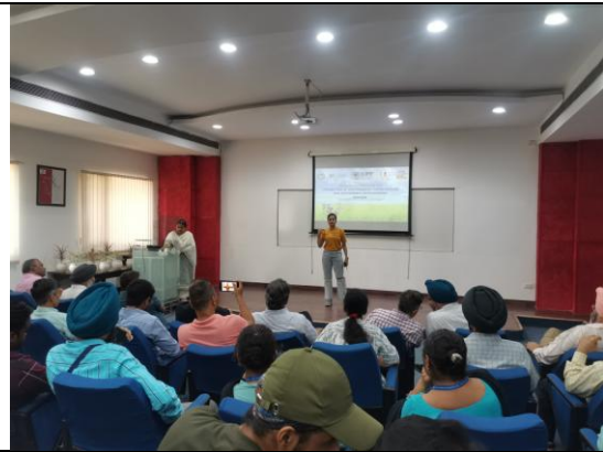
Briefing by student on the occasion