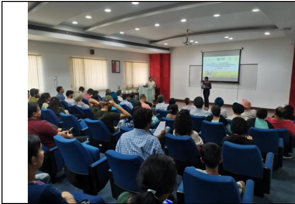
Workshop attended by participants