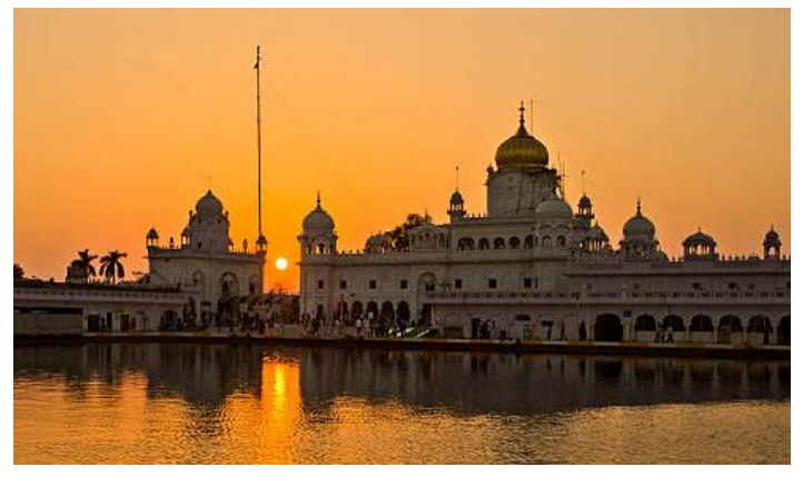
Dukh Niwaran Sahib, Patiala

Famous for 'phulkari chunni' (traditional flower work dupattas), 'pagri' (turban), 'paranda' (tasseled tag for braiding hair) and 'jutti' (footwear), joyous buoyance, royal demeanor, sensuous and graceful feminine gait and Aristocracy, Patiala presents a beautiful bouquet of lifestyle even to a casual visitor to the city. A brilliant spectrum of Rajput, Mughal and Punjabi cultures, a fine blend of modernity and tradition and a judicious synthesis of all that is beautiful in form and bold in spirit conjure up a vision called 'Patiala'. Qila Mubarak Complex, Baradari Gardens, Gurudwara Dukh Niwaran Sahib, Kali Mata Mandir and National Institute of Sports are major attractions of the city. Patiala connects to Delhi, Ambala, and Chandigarh well by rail and road. It is around 280 Km from IGI Airport Delhi and 60 Km from Chandigarh Airport. Shimla, Dharamshala, Manali, and Amritsar are nearby cities of attraction.