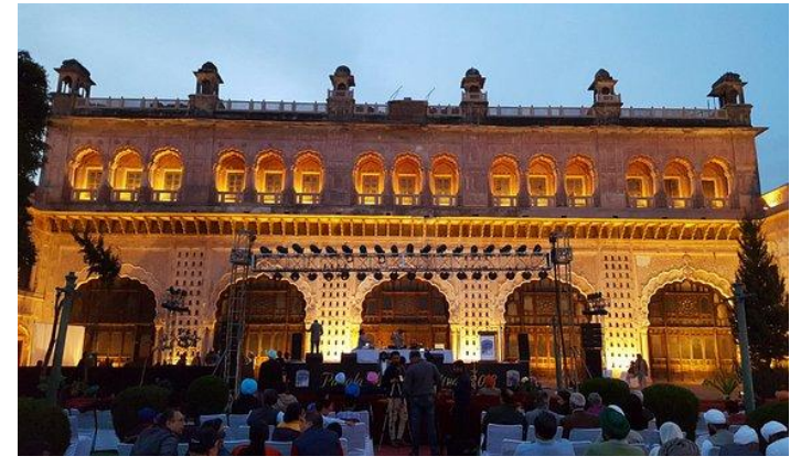
Qila Mubarak, Patiala